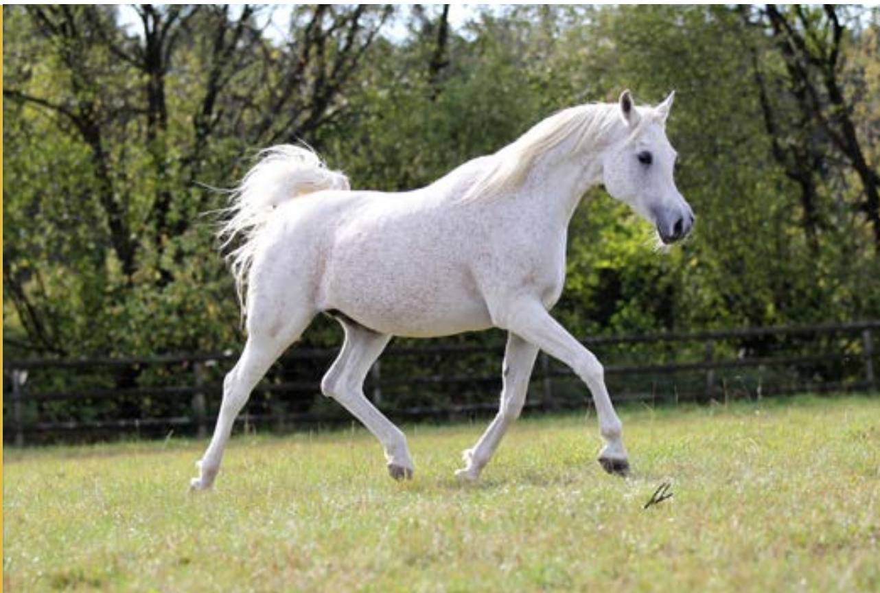
Dalima Shah Multi Champion mare by Ansata Halim Shah - one of our foundation mares