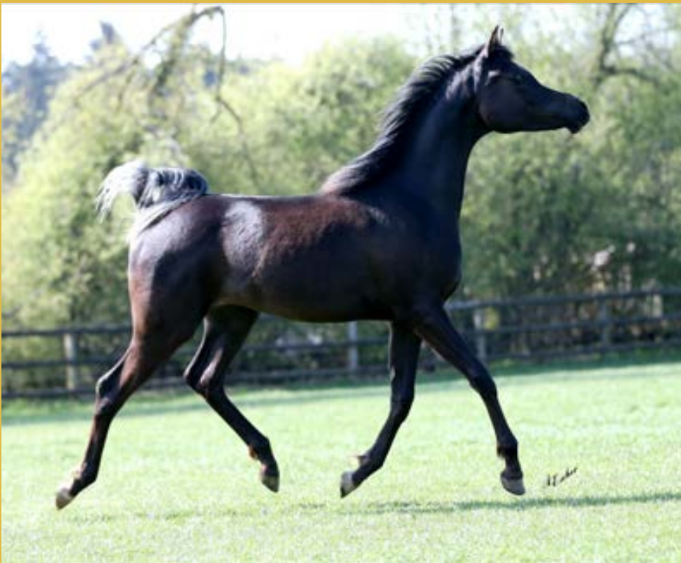
GR Larissa (GR Ishad x GR Layla) Abayan line - the future