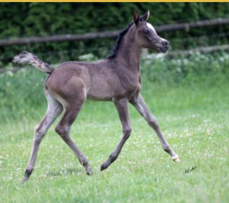
GR Adelle black filly 2022 (GR Ishad x GR Anastacia) - the future