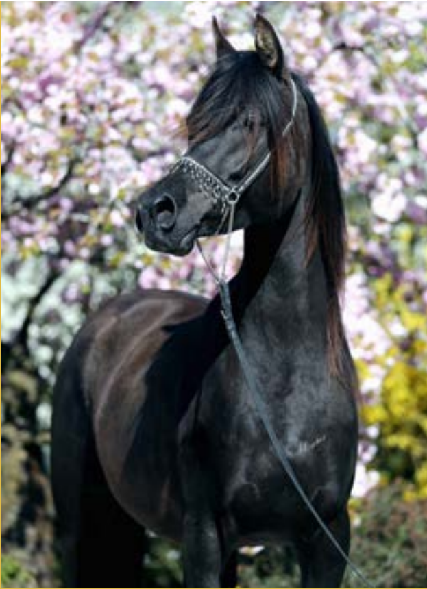
GR Layla (GR Faleeh x leasing-mare Sheherazade) - Abayyan line