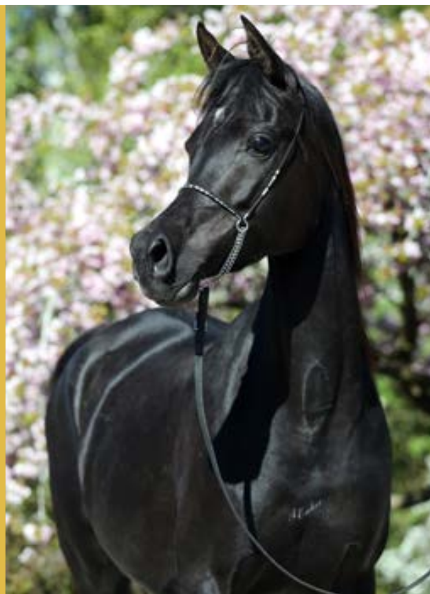
GR Aya Malukah (GR Faleeh x GR Aya Mahiba by Maheeb) goes back to Ansata Aya Maria, Bukra line