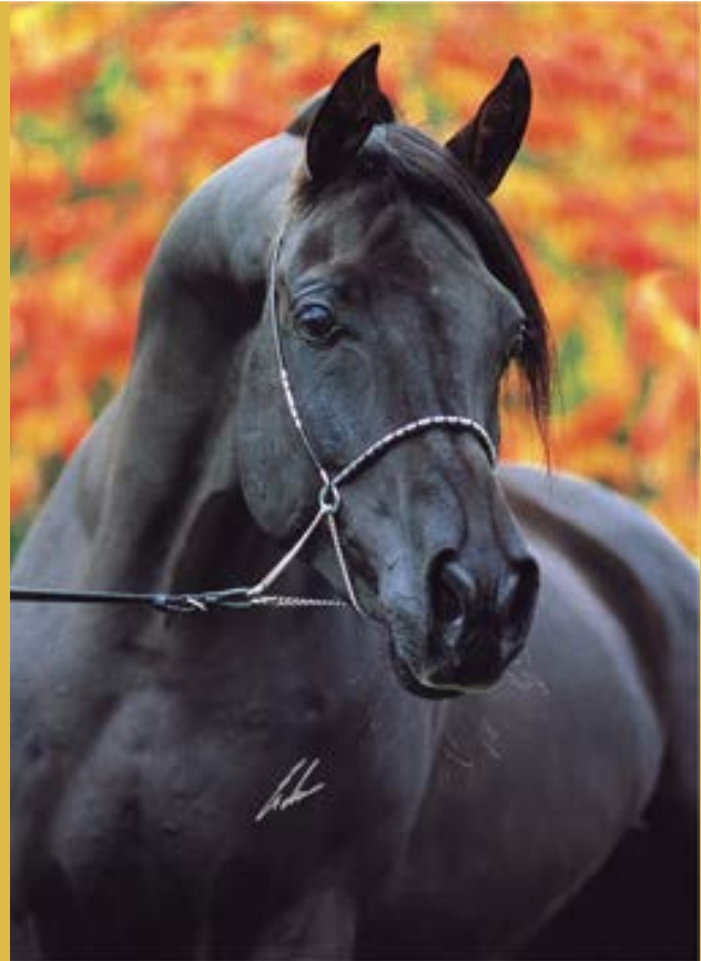
Madallan-Madheen (Ansata El Salaam x Madinah) - black gold premium stallion, foundation-stallion