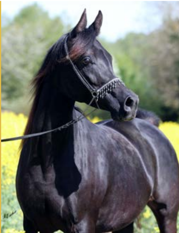
GR Farasha (Maheeb x Fasinah by Nahaman) - full-sister to GR Fasin