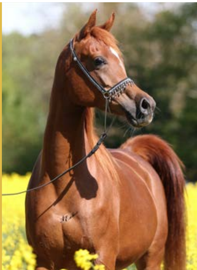
GR Anisha (GR Faleeh x GR Anastacia by Classic Shadwan)