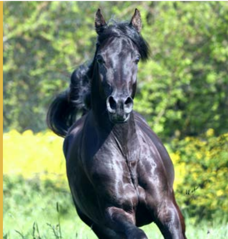
GR Fasin born 2019 (Maheeb x Fasinah by Nahaman) my youngest black gold premium stallion