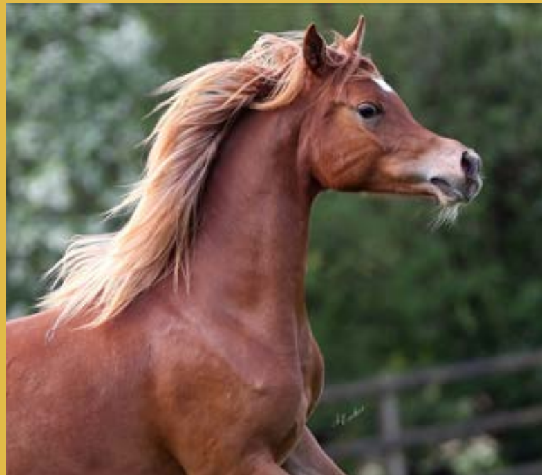
GR Alinah (GR Lahab x GR Anisha by GR Faleeh) great granddaughter of Halims Asmara - black producing