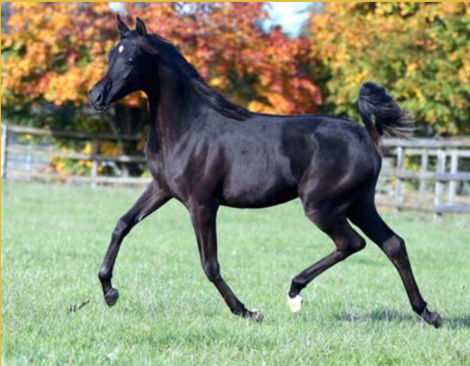
GR Fayadah 2022 (GR Ishad x GR Farasha, Maheeb x Fasinah) - the future