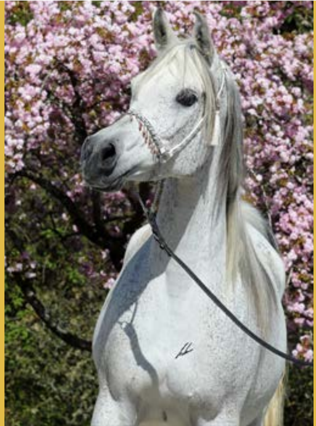
GR Nashidah (Classic Shadwan x Nejdshah) - mother of our homebred stallions GR Nashad (gold premium) and GR Lahab