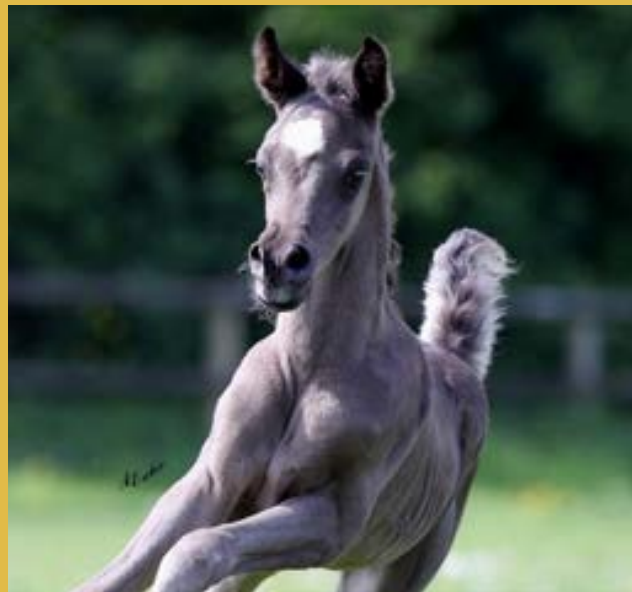
GR Shakadah black filly 2019 (GR Ishad x GR Shakirah, Maheeb x GR Shatigah) - great great granddaughter of Dalima Shah