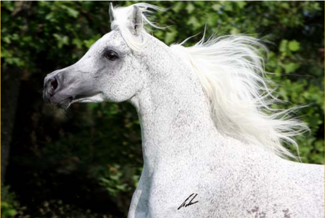
Classic Shadwan (Alidaar x Shagia Bint Shadwan) - Multi-Champion, foundation stallion