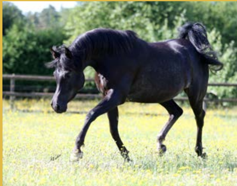
GR Mariyah (GR Moneef x Champion GR Marianah by Madallan-Madheen x Maria Halima), goes back to foundation-mare Maria Halima - in foal to GR Fasin