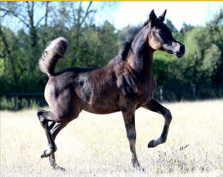
GR Nasirah black-bay filly *2022 (GR Fasin x GR Nashidah by Classic Shadwan) - GR Fasin's first foal